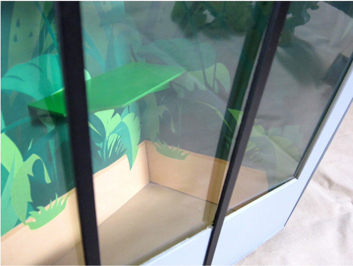
Platforms of any size and shape can be added.